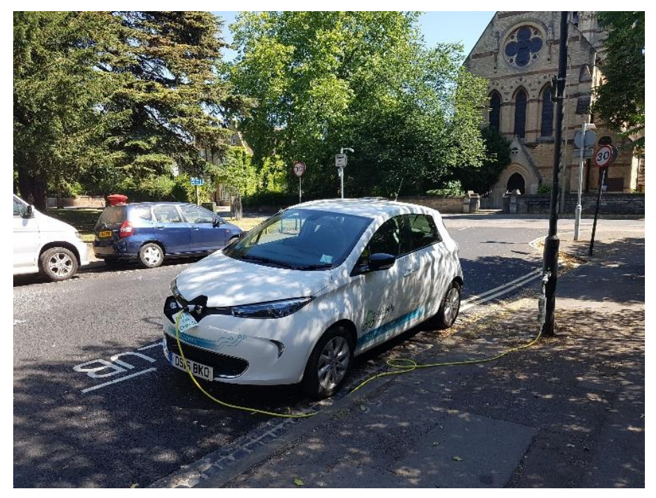
A car-club vehicle charging from a converted lamppost in central Oxford.

The first phase of GULO trialled five different on-street EV charging technologies across 28 locations on public streets in Oxford. Private ULEV users and car club members using ULEVs participated in the trial.